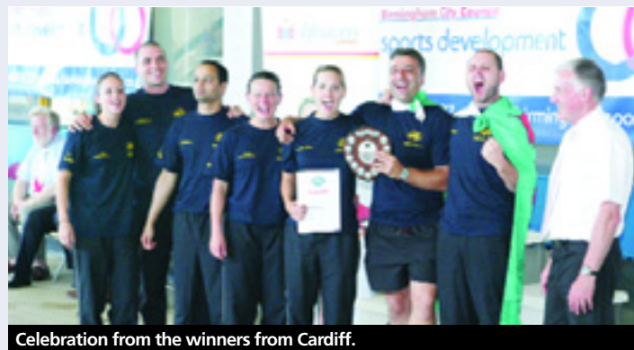
Celebration from the winners from Cardiff.

DC Leisure's team, Pavilions in the Park, won the third event – pool incident – convincingly. They acted proactively and effectively to ensure the damage from any incidents was minimised. There was hilarity for some spectators when Birmingham City were penalised for rescuing too